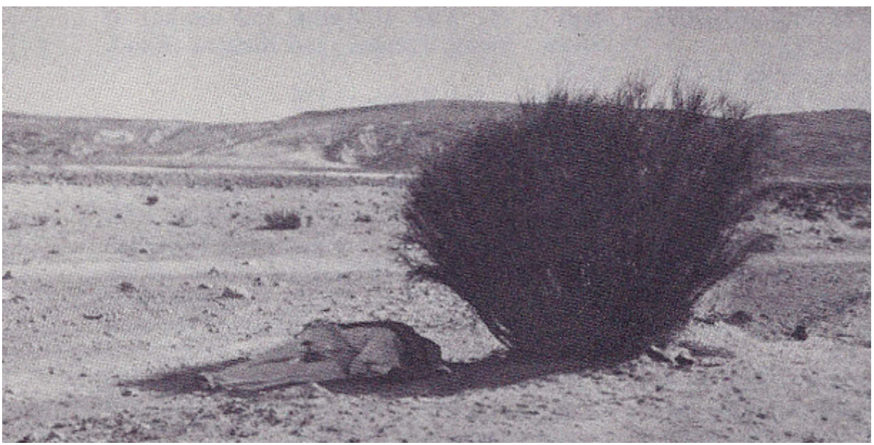
Traveller's rest, Kadesh . An Arab traveller dozes beneath a broom bush in the wilderness along the Negev Desert. In this same area Elijah stopped to rest beneath a juniper tree and received encouragement from an angel of the Lord (1 Kings 19:4-7).

Elihu ("God himself"). [1] One who joined David at Ziklag (1 Chron. 12:20). [2] A porter at the tabernacle at the time of David (1 Chron. 26:7). [3] The youngest "friend" of Job (Job 32:2,4-6). [4] See Eliab [3]. [5] See Eliab [4].