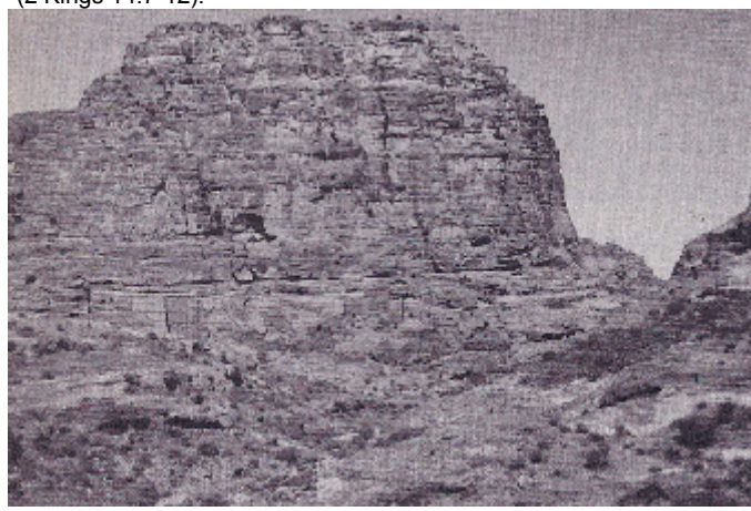
Petra. Selah, the towering rock fortress of the Edomites, was the foundation of the city of Petra . The defeat of this stronghold prompted Amaziah of Judah to challenge Jehoash of Israel to war (2 Kings 14:7-12).

Amos ("burden-bearer; burdensome"), a prophet during the reigns of Uzziah and Jeroboam (Amos 1:1; 7:10-12, 14).