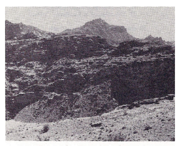
Mount Hor. The burial place of Aaron (Deut. 32:50), Mount Hor is traditionally identified with the modern-day peak of Jebel Nebi Harun. Over 1,500 m. (4,800 ft.) high, the mountain stands to the west of Edom.

In a few cases, our English versions use the same word to transliterate several similar Hebrew names. In these instances, we have recorded a separate entry for each Hebrew name (e.g., Iddo).